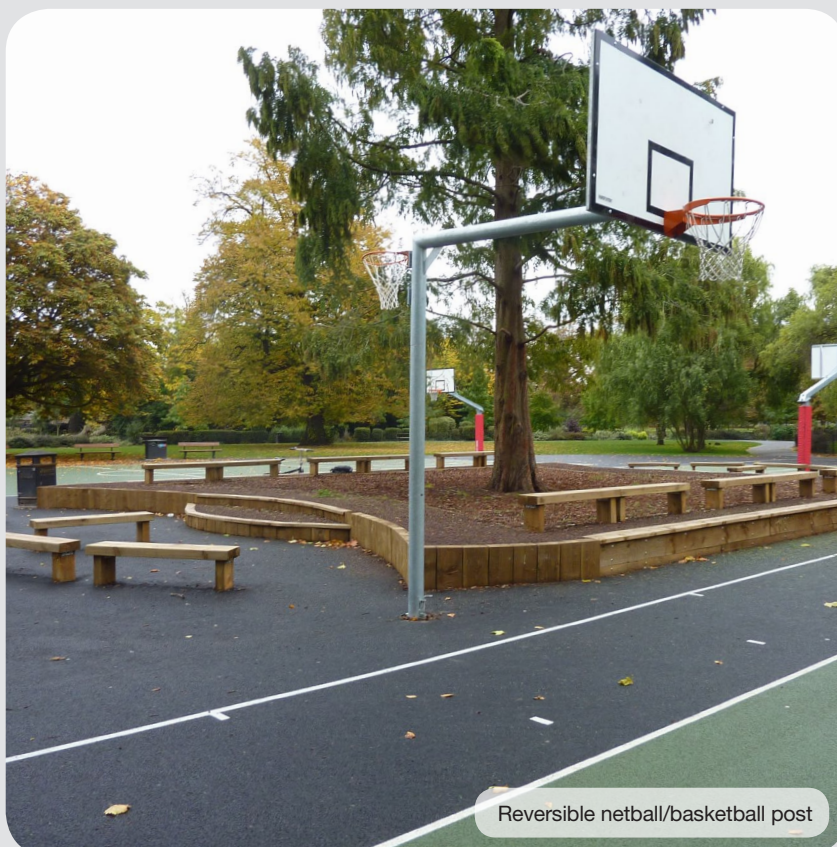
Reversible netball/basketball post