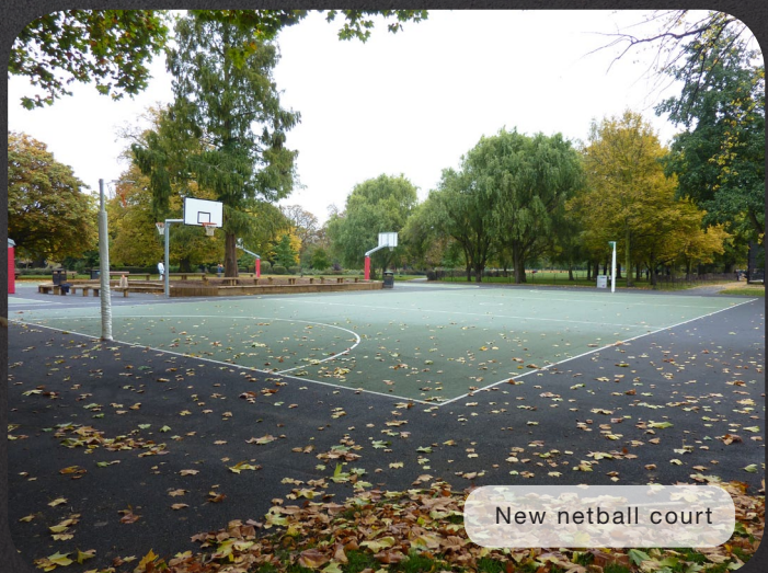
New netball court