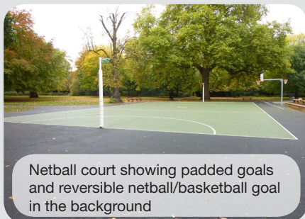
Netball court showing padded goals and reversible netball/basketball goal in the background

There are over 200 specialist user groups in the park for basketball and the client is receiving calls from basketball groups all over the country with requests to visit the site.